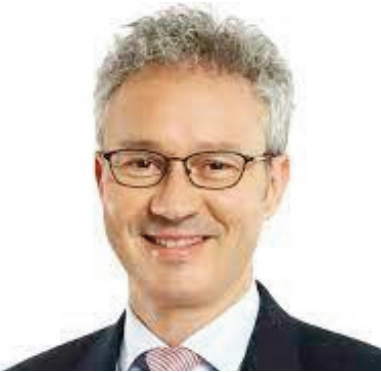
SYDNEY MORNING HERALD JOSH BORNSTEIN

WOMEN WORKING IN PARLIAMENT HAVE A RIGHT TO SAFE WORKPLACES IN THE SAME WAY AS WOMEN EMPLOYED ELSEWHERE. THAT CANNOT BE ASSURED UNLESS A PROPER INVESTIGATION IS CONDUCTED